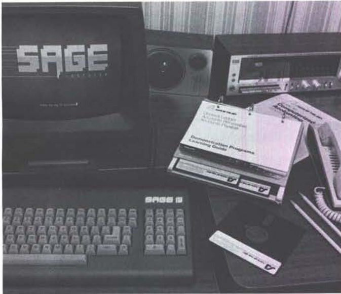
The SA Demo package is an excellent sales tool.