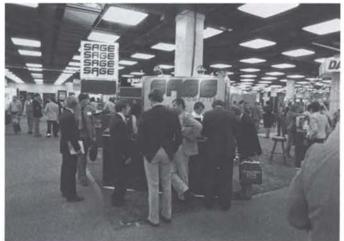
Our booth at CP/M '83 East was always busy.

CP/M-68K is one of 4 operating systems that now runs on the multi-user BIOS of the SAGE. What makes the product unique is that a user can put different OS's on the same machine. At Boston we were running CP/M on three terminals and had the p-System on the other.