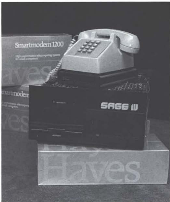
The Hayes Smartmodem is perfect for the SAGE Computer.