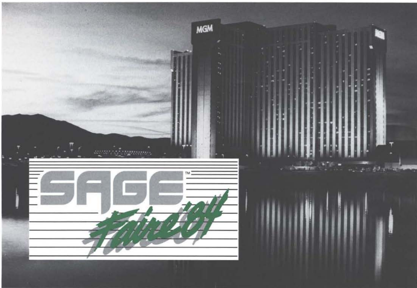
The MGM Grand Hotel/Casino in Reno will be headquarters for SAGE Faire '84.