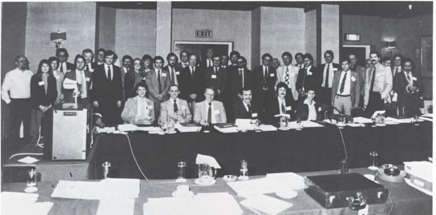
Delegates from 15 countries attended the SAGE Atlantic Region Conference.

Annual conferences like the Heathrow event are scheduled for both the Atlantic and Pacific regions with the next one set for the Far East in mid '84.